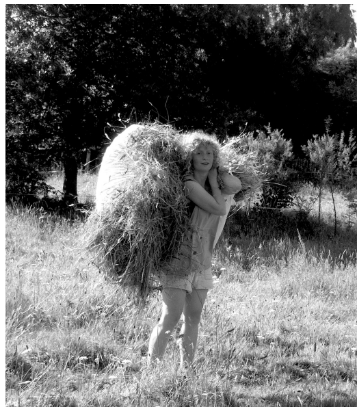
Taking hay up to the barn in a sheet bundle, Summer 2013

If you would like a copy to take home (£1) please ask in the office or shop.